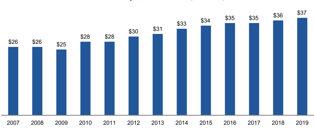
Size of U.S. Optical Retail Market ($ in billion)

The U.S. optical retail industry, defined by Vision Monday to include optical retailers' revenues from the sales of products (including managed vision care benefit revenues and omni-channel and e-commerce sales) and eye care services provided by vision care professionals, including eye exams, is a $37 billion industry that has exhibited consistent, stable growth across economic cycles. According to Vision Monday, over the period from 2007 to 2019, the industry grew from $26 billion to $37 billion in annual sales, representing a compound annual growth rate ("CAGR") of 3.2%. The industry experienced only a modest decline during the 2008 to 2009 recession and rebounded with robust post-recession sales growth of 4.0% CAGR from 2009 to 2019, according to Vision Monday. The steady growth of the industry and its resilience to economic cycles is due in large part to the medical, non-discretionary and recurring nature of eye care purchases.